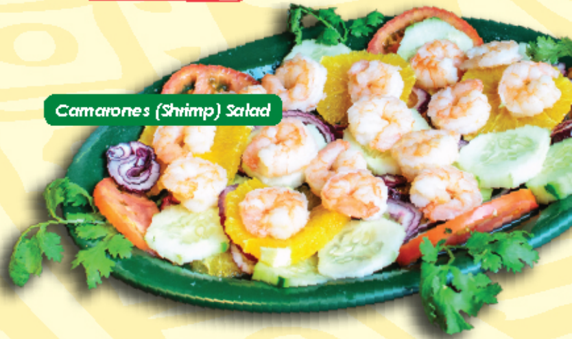
Camarones (Shrimp) Salad