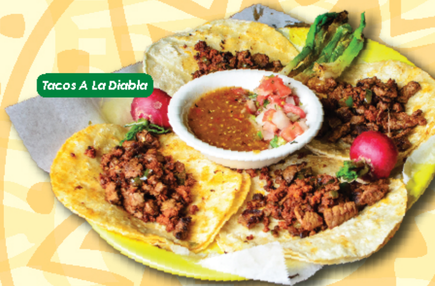
Tacos A La Diabla