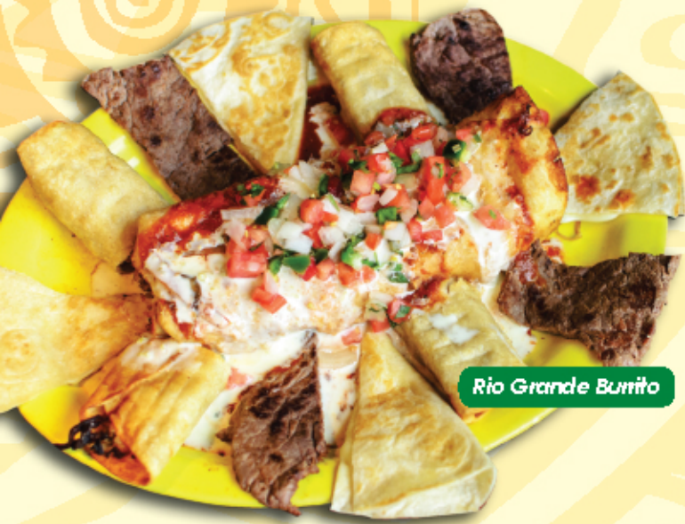
Rio Grande Burrito